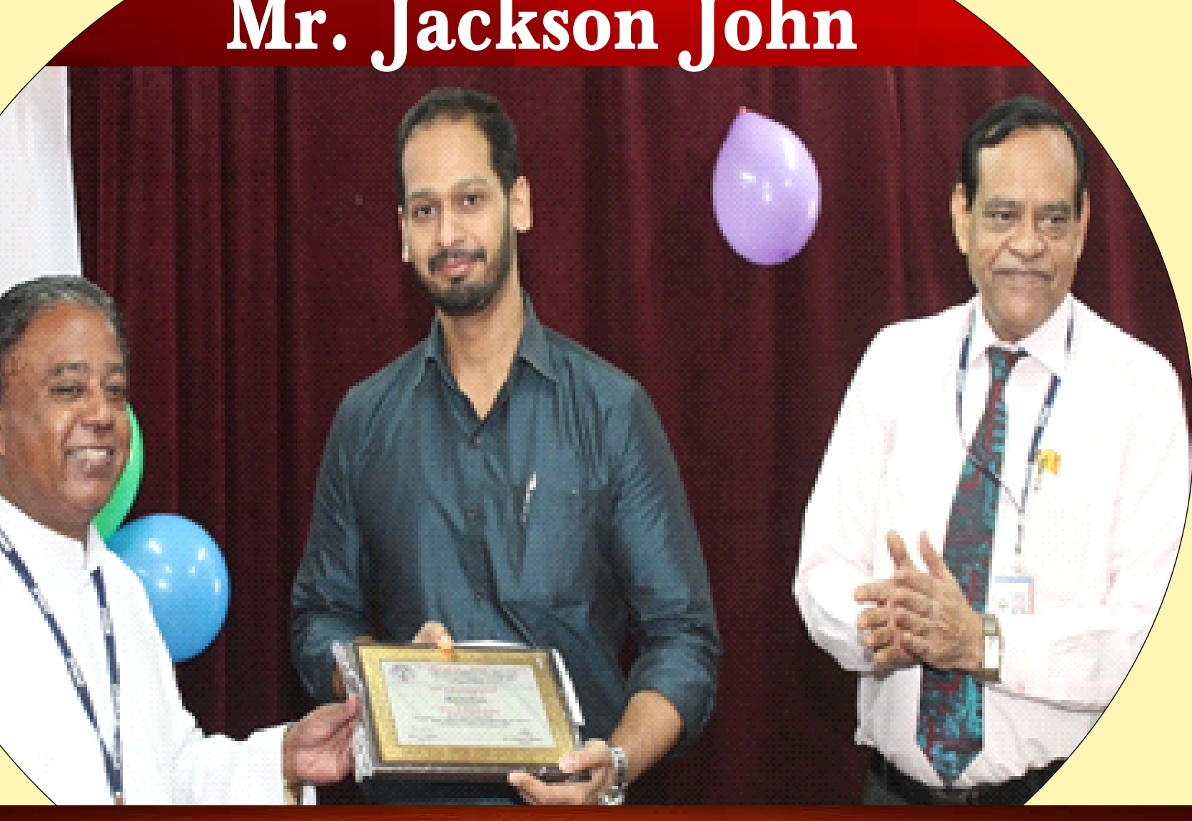
Best Research Paper Award 2nd Prize- 2017, SFIMAR