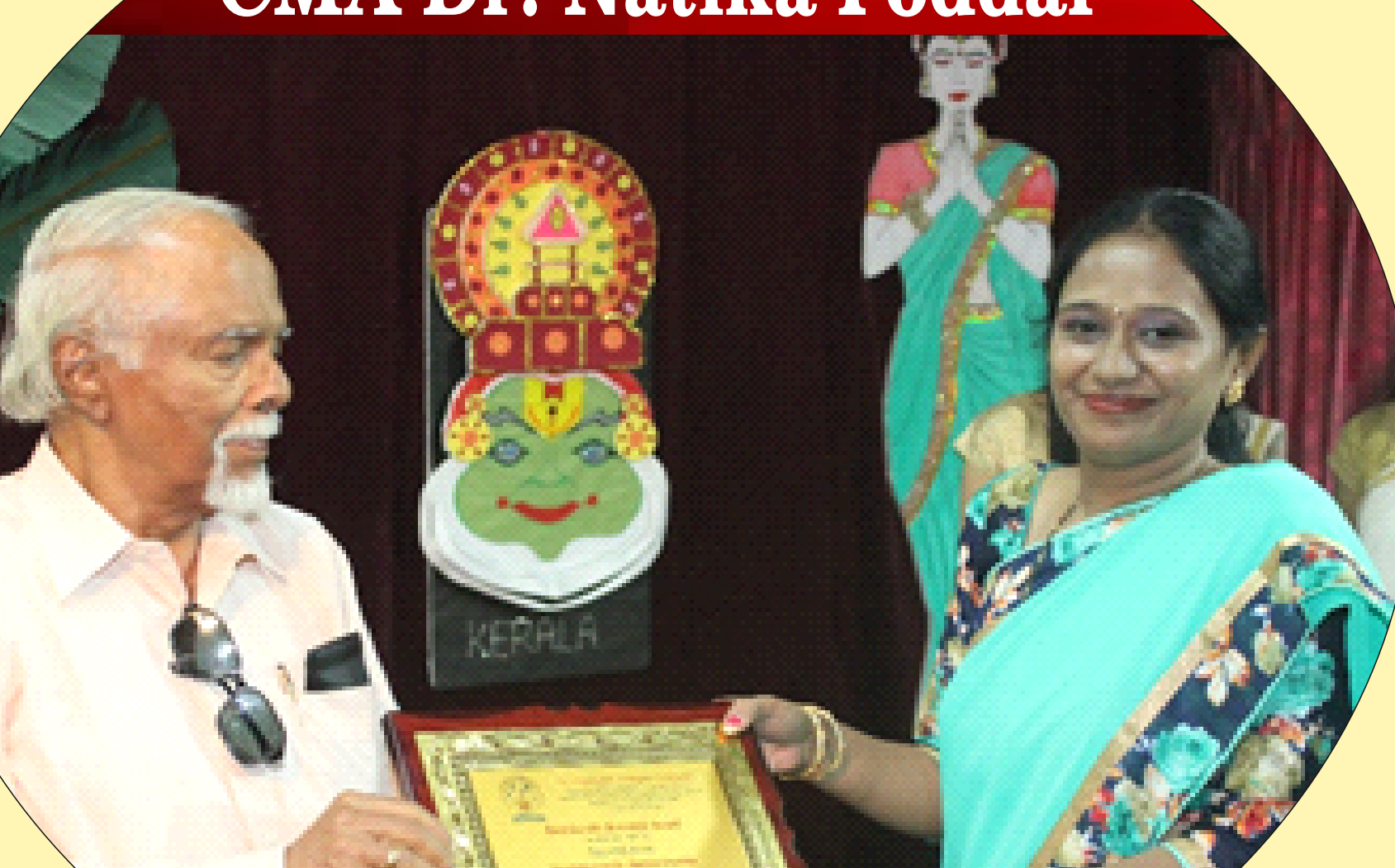
Best Research Paper Award 2nd Prize- 2016, SFIMAR