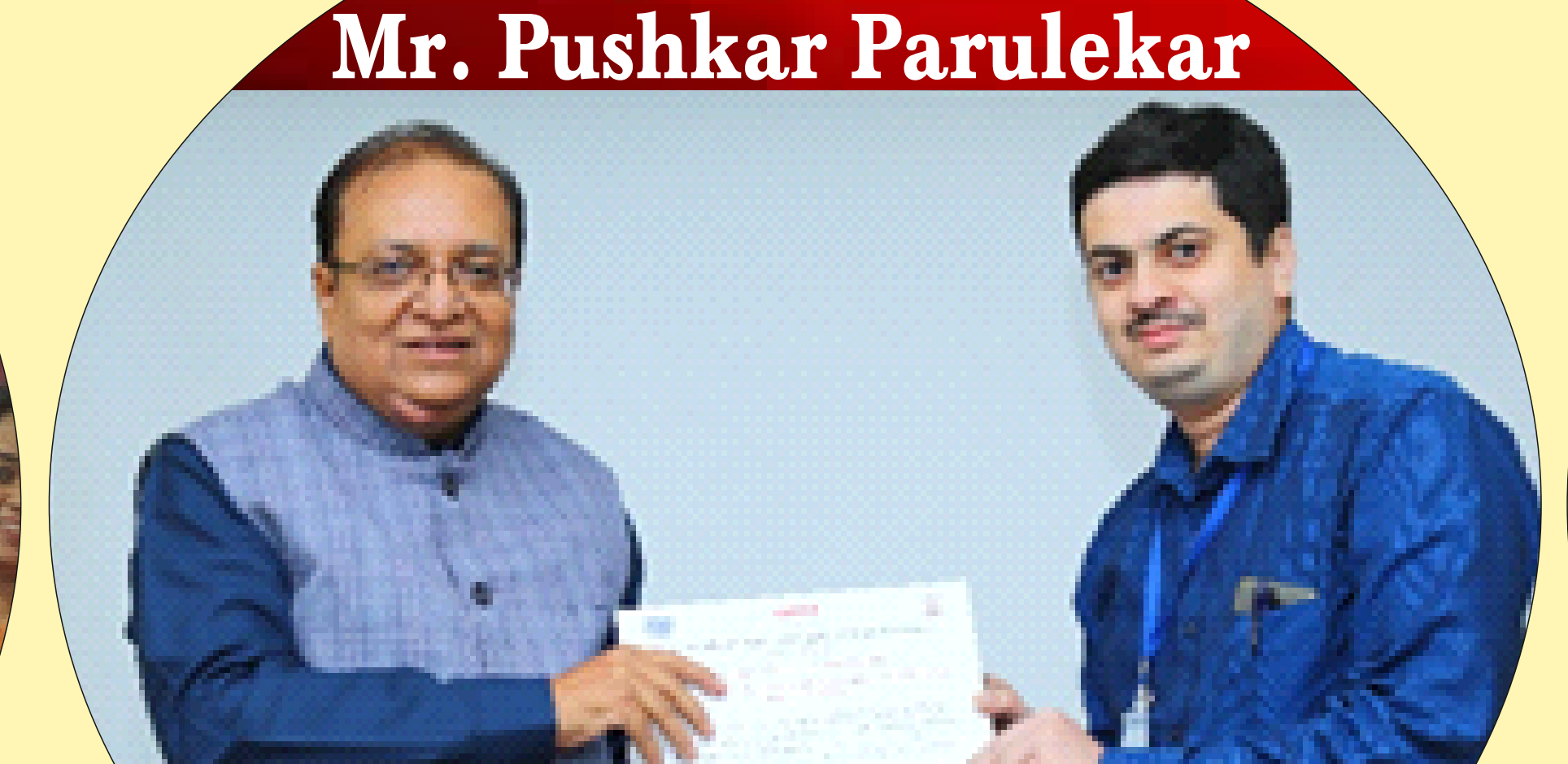
Best Paper Award-"Analysis of Risk and Returns of Public sector banks - (Study to Find out Risk and Returns Generated by Public Sector Banks From 2003 To 2018)" was presented at SIFICO 2019"