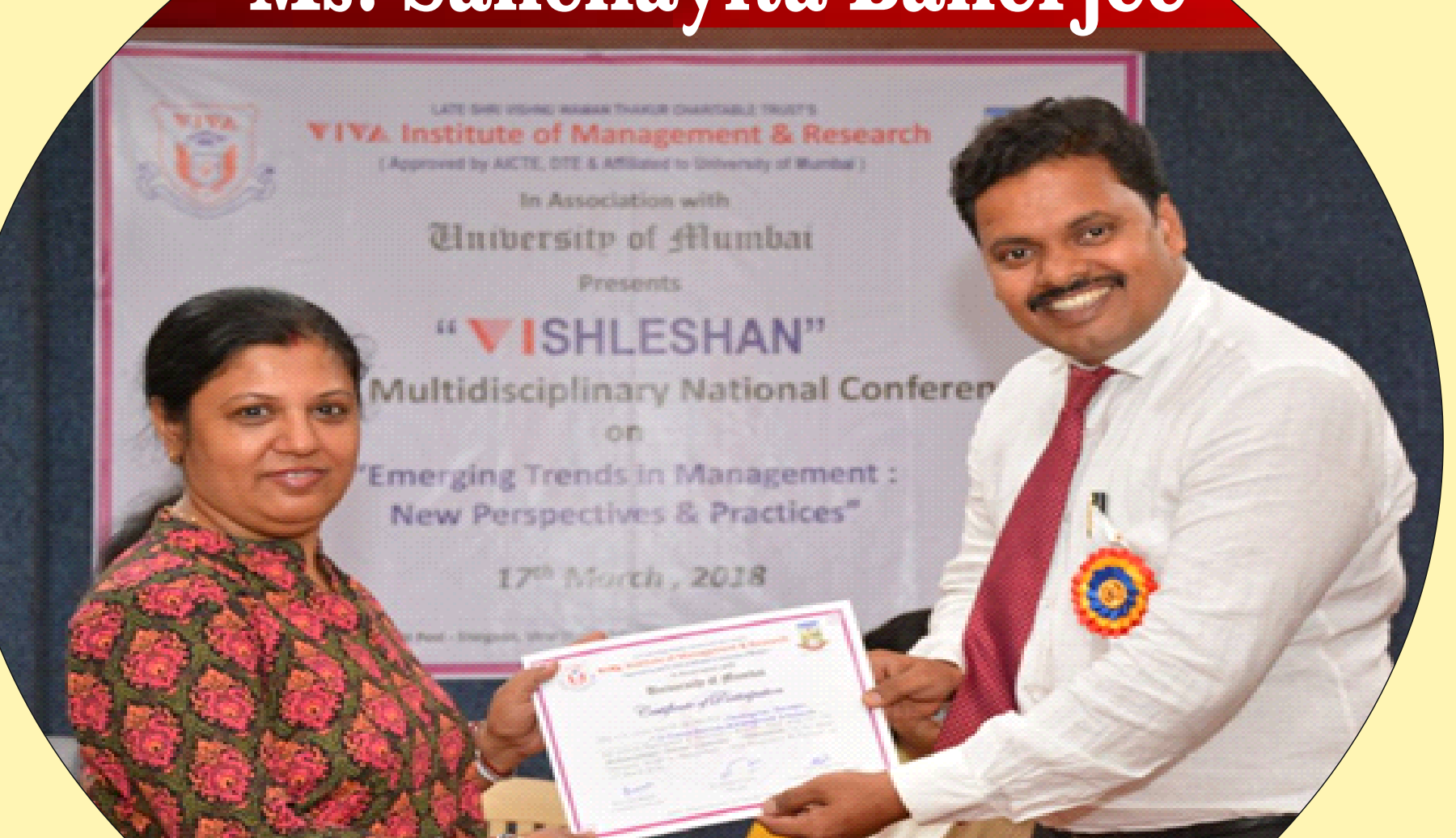
Best Research Paper Award Vishleshan 2018- VIVA Institute