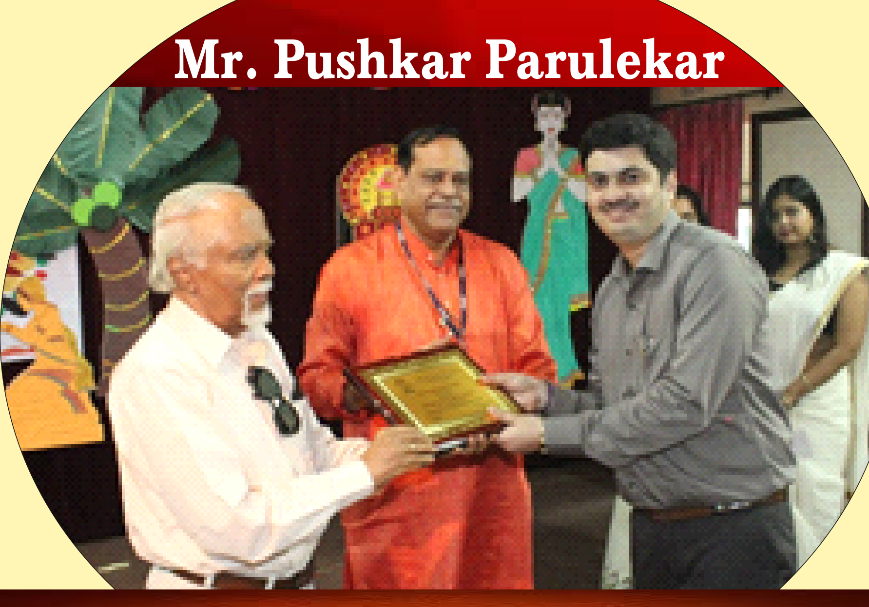
·Best Faculty Research Award - SFIMAR, 1st prize 2016