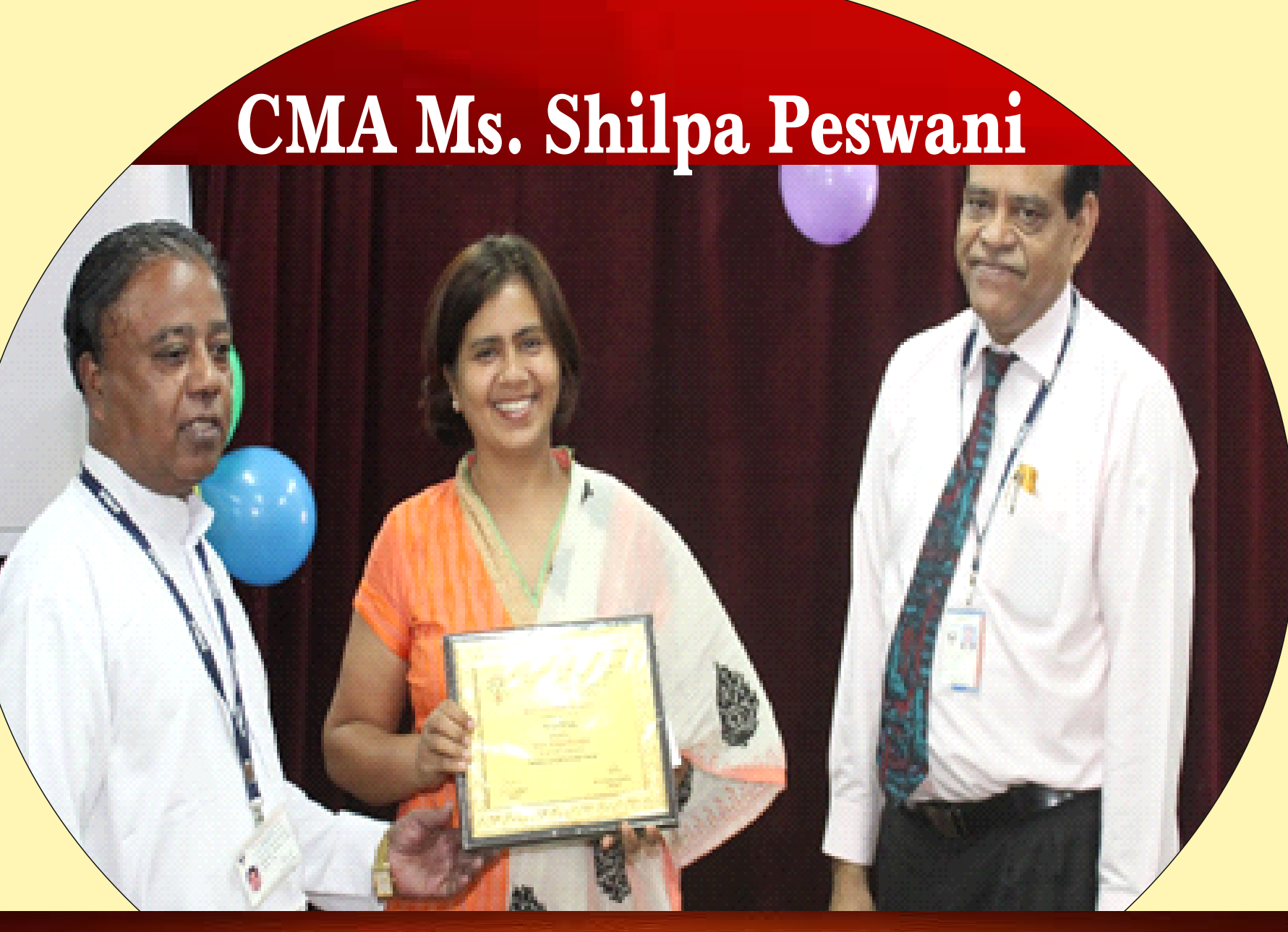
Best Research Paper Award 1st Prize- 2017, SFIMAR