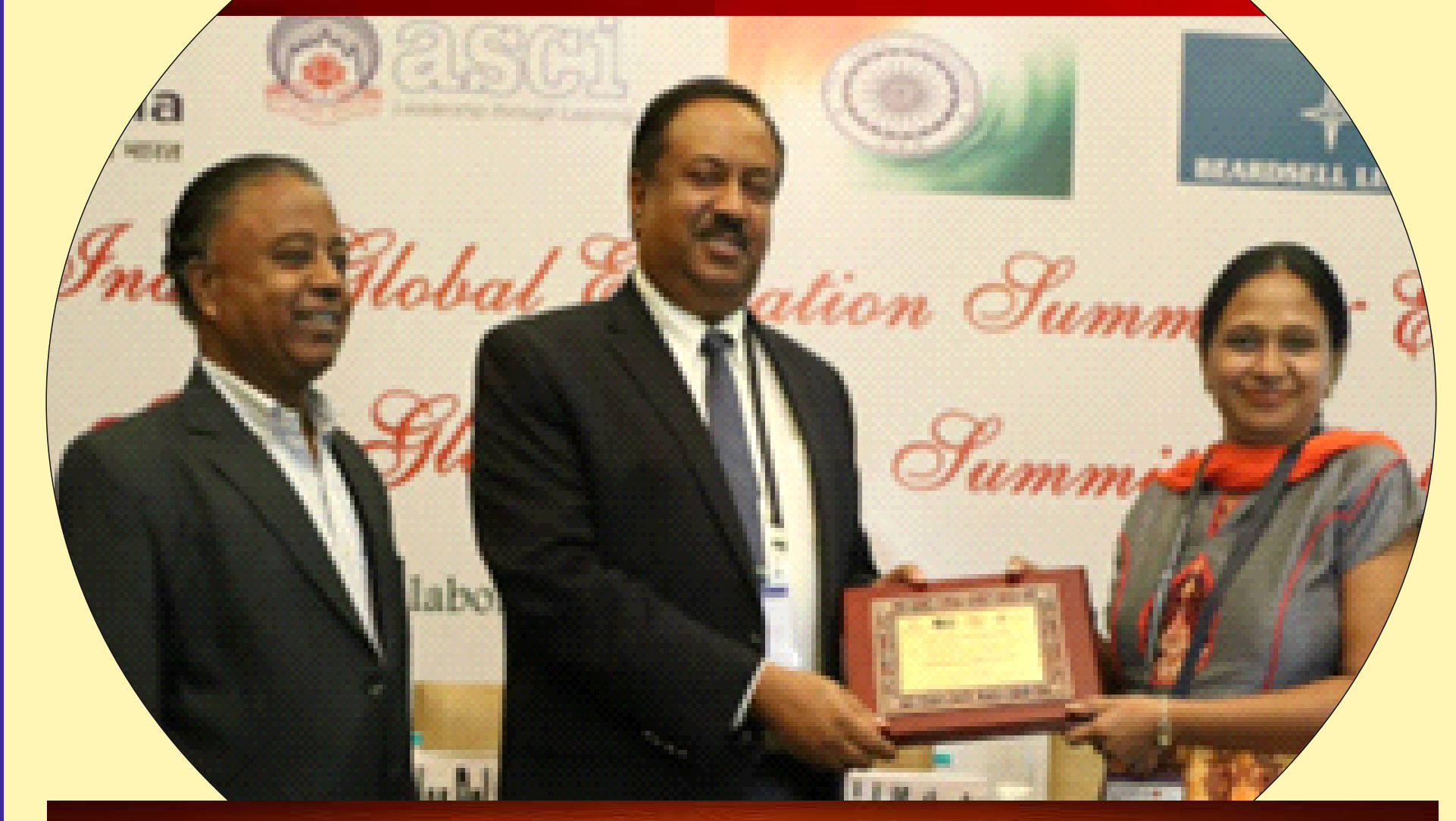
Honoured with Research Excellence Award 2017- Indo Global Education Summit